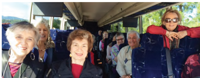
On the Bus heading to Sacramento, May 12, 2015

Senior Excursions are sponsored with the generous support of the Senior Excursion Fund of the Jewish Community Federation of San Francisco, the Peninsula, Marin and Sonoma Counties.