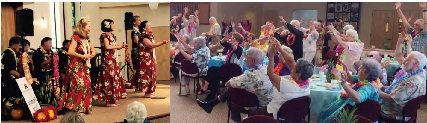
Friends of the Island performing at the 2015 Friendship Circle Membership Tea on July 19

The Friendship Circle is a Program of the Jewish Community Center, Sonoma County