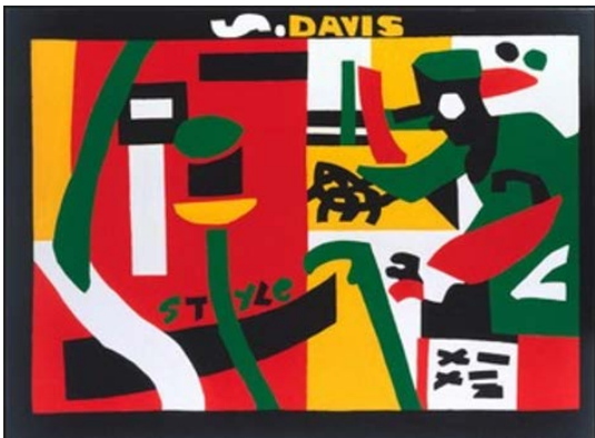
Night Life, Stuart Davis, 1962, oil on canvas

To receive your FREE zoom link go to REQUEST A RESERVATION