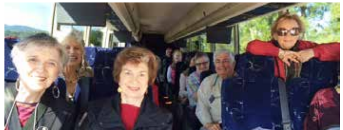
On the Bus heading to Sacramento, May 12, 2015

Senior Excursions are sponsored with the generous support of the Senior Excursion Fund of the Jewish Community Federation of San Francisco, the Peninsula, Marin and Sonoma Counties.